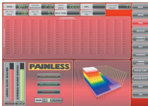
PowerCom Fuel Data Screen