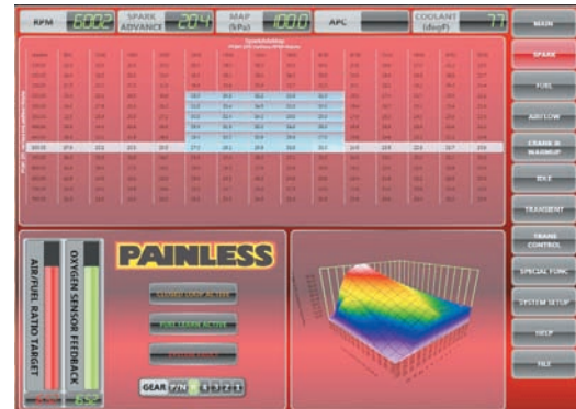
PowerCom Spark Data Screen